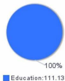
Table1: MSYs by Focus Areas